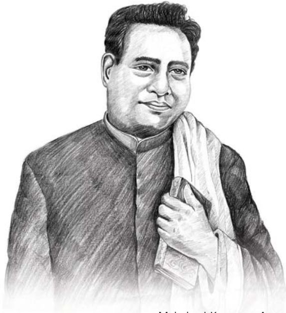
- Mahakavi Kumaran Asan (1873-1924)

“ The Association is truly a living tribute to the memory of Mahakavi Kumaran Asan, the late Poet Laureate of Kerala ”