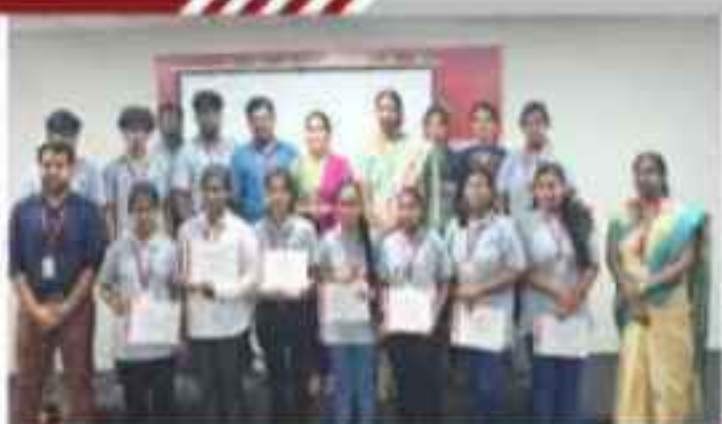
TVS FINANCE ANALYTICS COURSE COMPLETION