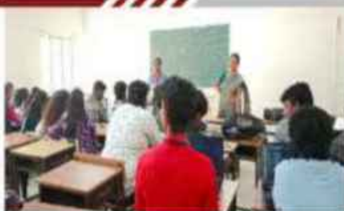
SESSION ON HIGHER EDUCATION FOR COMPUTER SCIENCE STUDENTS