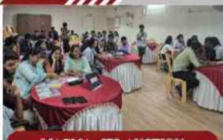
MAGMA - IPL AUCTION