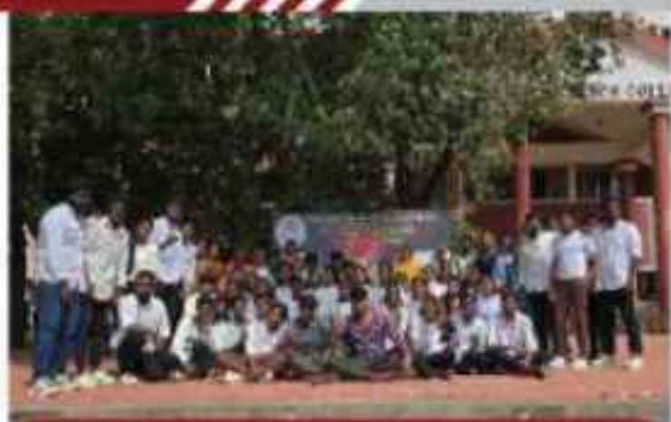
AIM TO IGNITE - POSTER LAUNCH