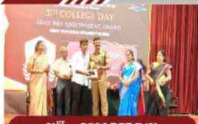
31 ST - COLLEGE DAY