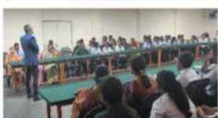
LOGISTICS TRAINING SESSION