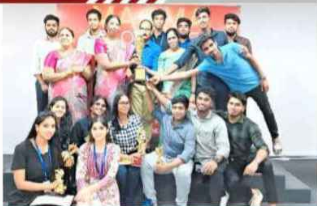
MAGMA - OVERALL CHAMPIONSHIP